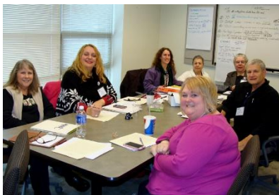
NYSUT’s World Language Subject Area Committee works on world languages being in the forefront of education for our NYS students.