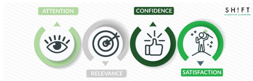
Figure 1 Retrieved from https://www.shiftelearning.com/blog/motivation-arcs-elearning