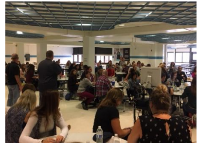
Participants posted sessions and shared information at EdCamp LI in November

EdCamp offered educators from Long Island an opportunity to gather and discuss practices taking place in the area. Follow EdCampLI on twitter to find out about next year’s events. (@EdCampLI) World Language teachers are encouraged to attend this free conference so there can be a forum for world language based sessions.