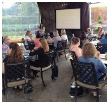
LECN Y members enjoy a beautiful day of professional development

Following the keynote, session one was an edcamp style workshop where teachers met in groups to discuss topics of interest to them. After a delicious lunch of salad and flatbread pizzas, participants were able to sample wines on their way to session two. The day ended with an immersion session where participants played games from the target culture. Lots of laughter ensued as Coco Koseki and Beth Ait Oumessaoud led these interactive sessions!