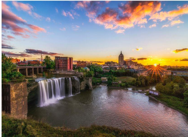
High Falls District, Rochester, NY.

NYSAFLT 101st ANNUAL CONFERENCE INSPIRING PROFICIENCY FOR LIFE ROCHESTER RIVERSIDE HOTEL October 19-20, 2018